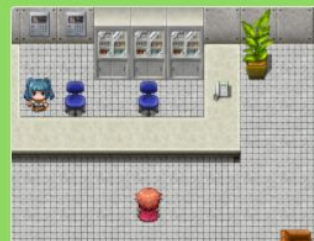
BREAK EVEN POINT HOUSE